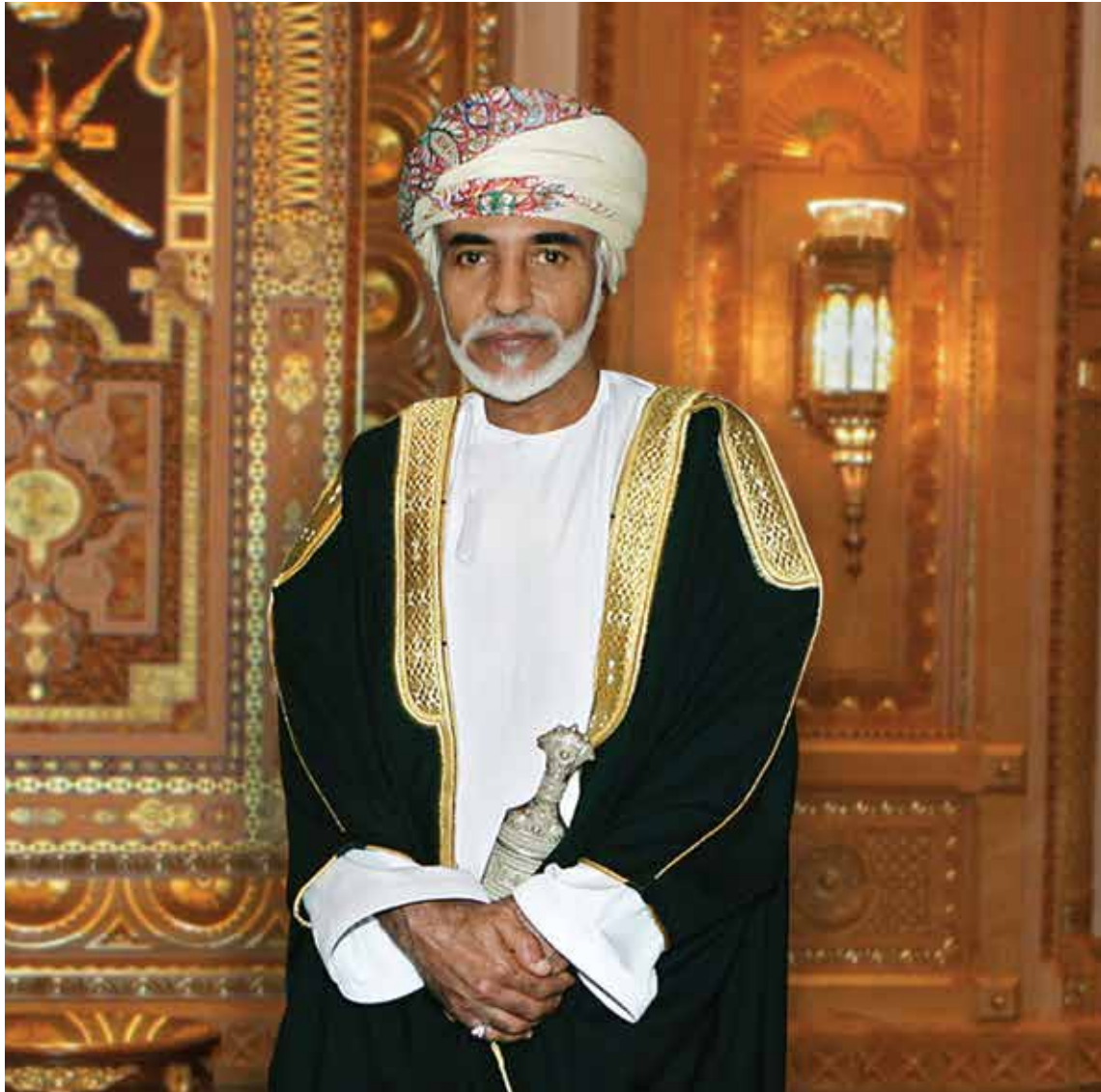
His Majesty Sultan Qaboos bin Said, Sultan of Oman