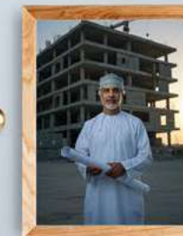
🏢 Construction of the Investment Building of Al Suwaiq Sport Club