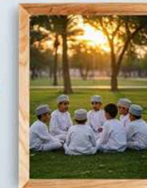
🌳 Construction of Suwaiq Park