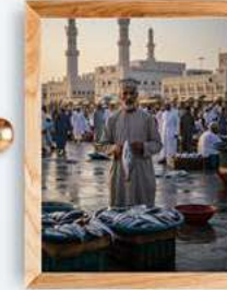
🏪 Construction of Liwa Fish, Vegetable and Fruit Market