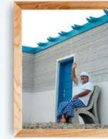
🏠 Concrete 3D Printed Fishermen Shades