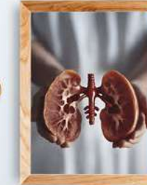
🏥 Construction of a Dialysis Unit